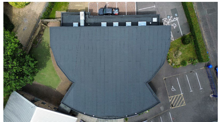
Roof after refurbishment works